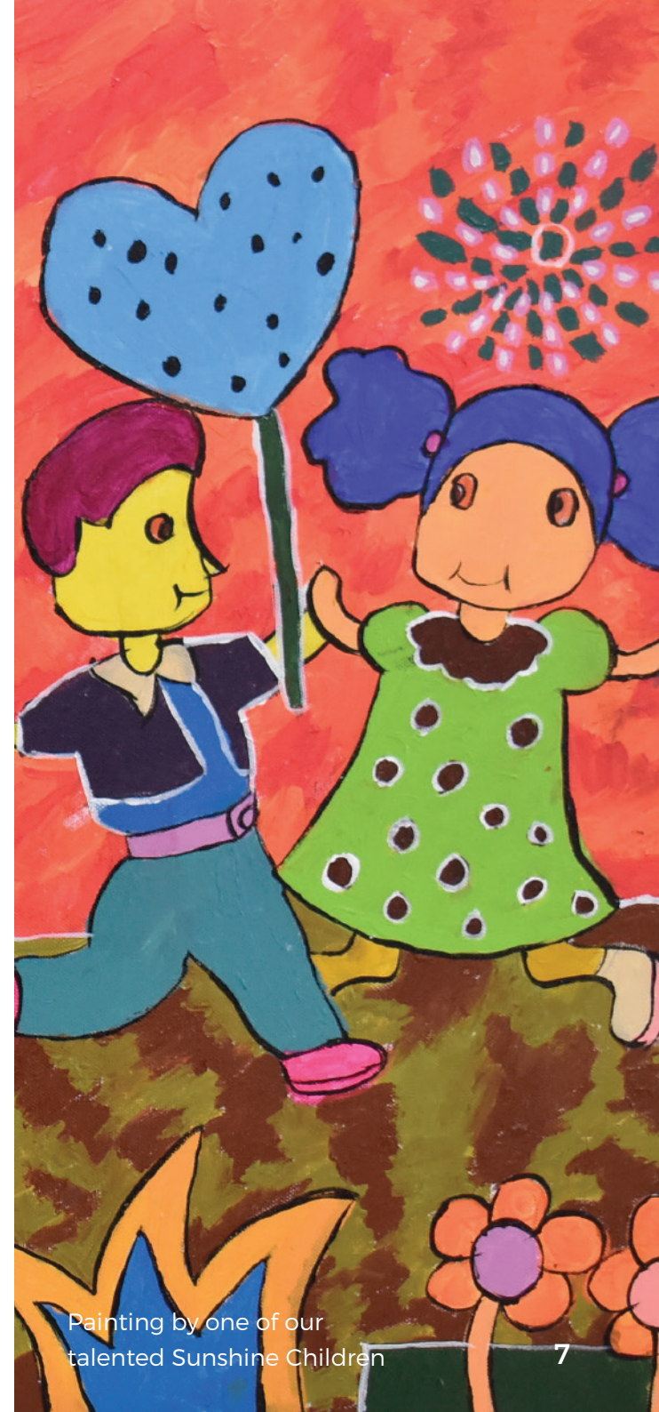
Painting by one of our talented Sunshine Children

10 CHILDREN were from the Sunshine Social & Medical Centre