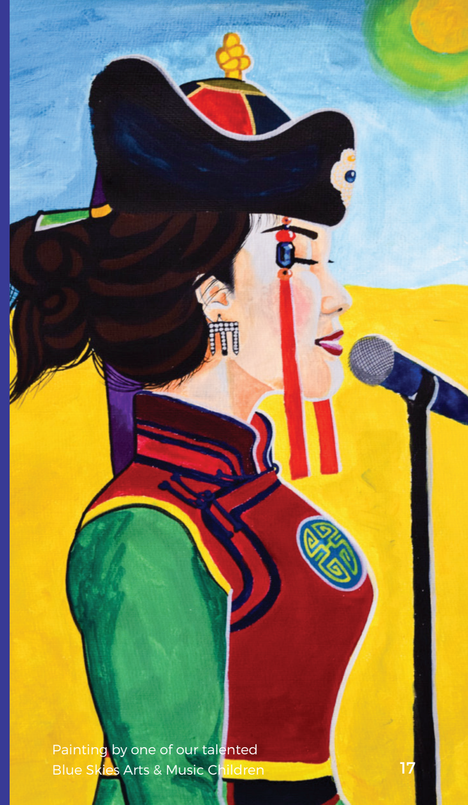
Painting by one of our talented Blue Skies Arts & Music Children

The advanced class enables the students to gain greater insight into a variety of artistic techniques such as painting with oils, sculpture and working with clay. Throughout the year, a core group of ten students is established who have shown a keen interest in arts and great commitment to the subject. They have produced an array of captivating art pieces. Their growth and development as artists is evident.