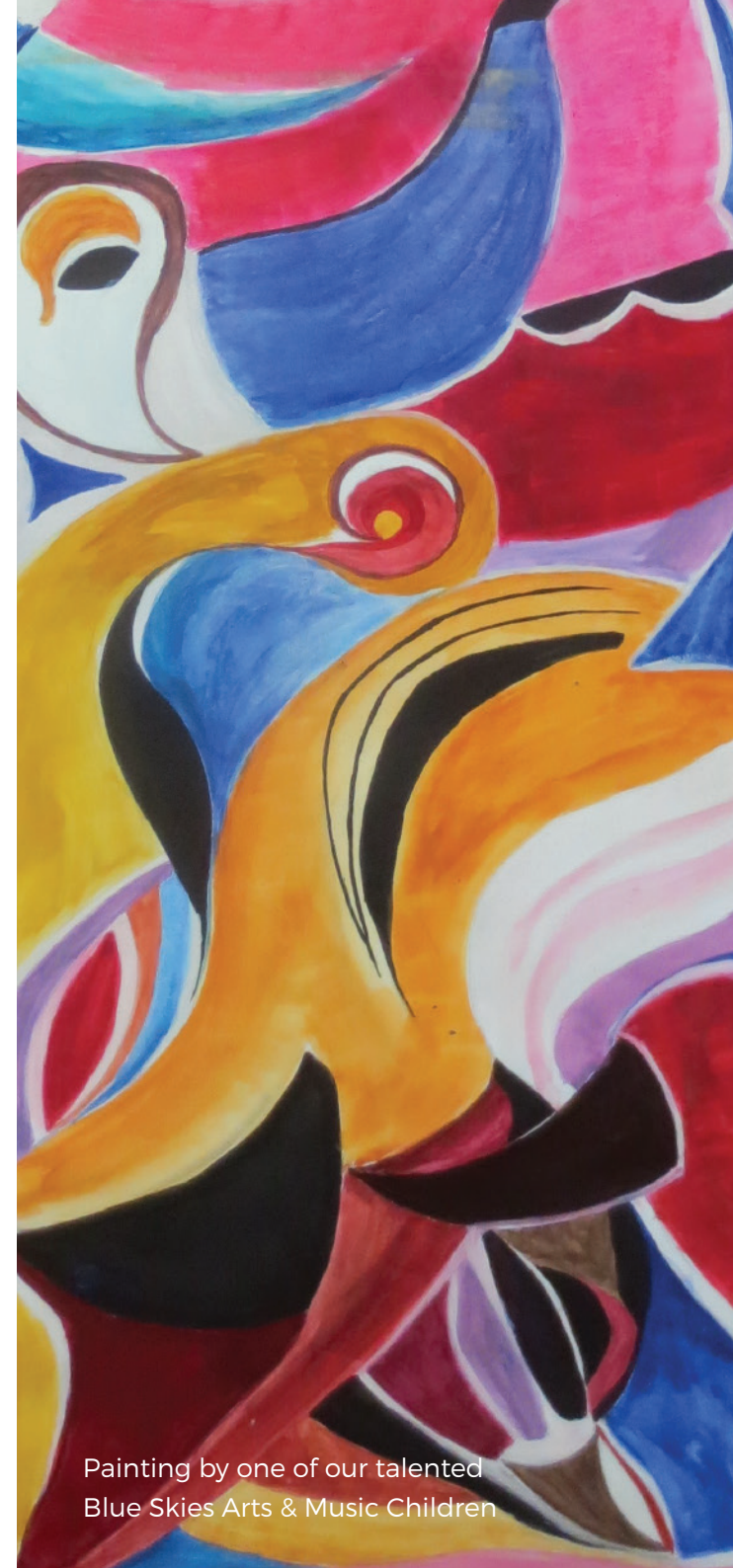
Painting by one of our talented Blue Skies Arts & Music Children

78 CHILDREN were from the Boys' Prison Education Programme