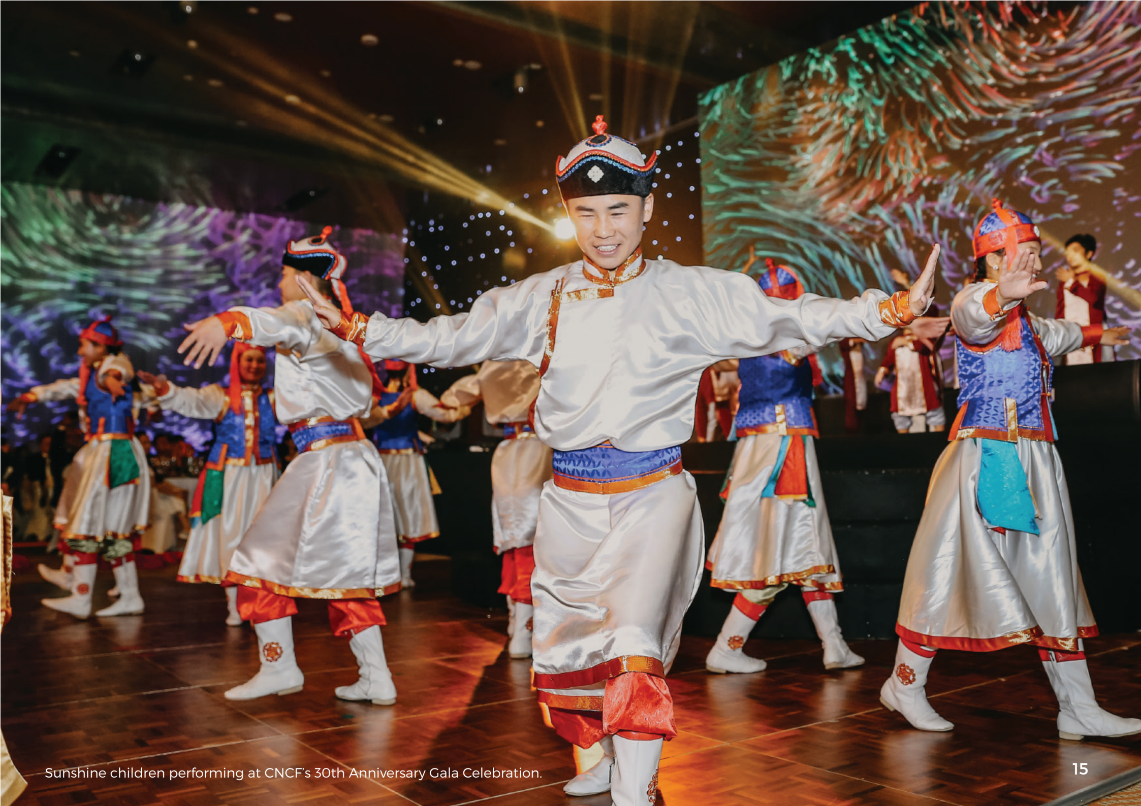
Sunshine children performing at CNCF's 30th Anniversary Gala Celebration.