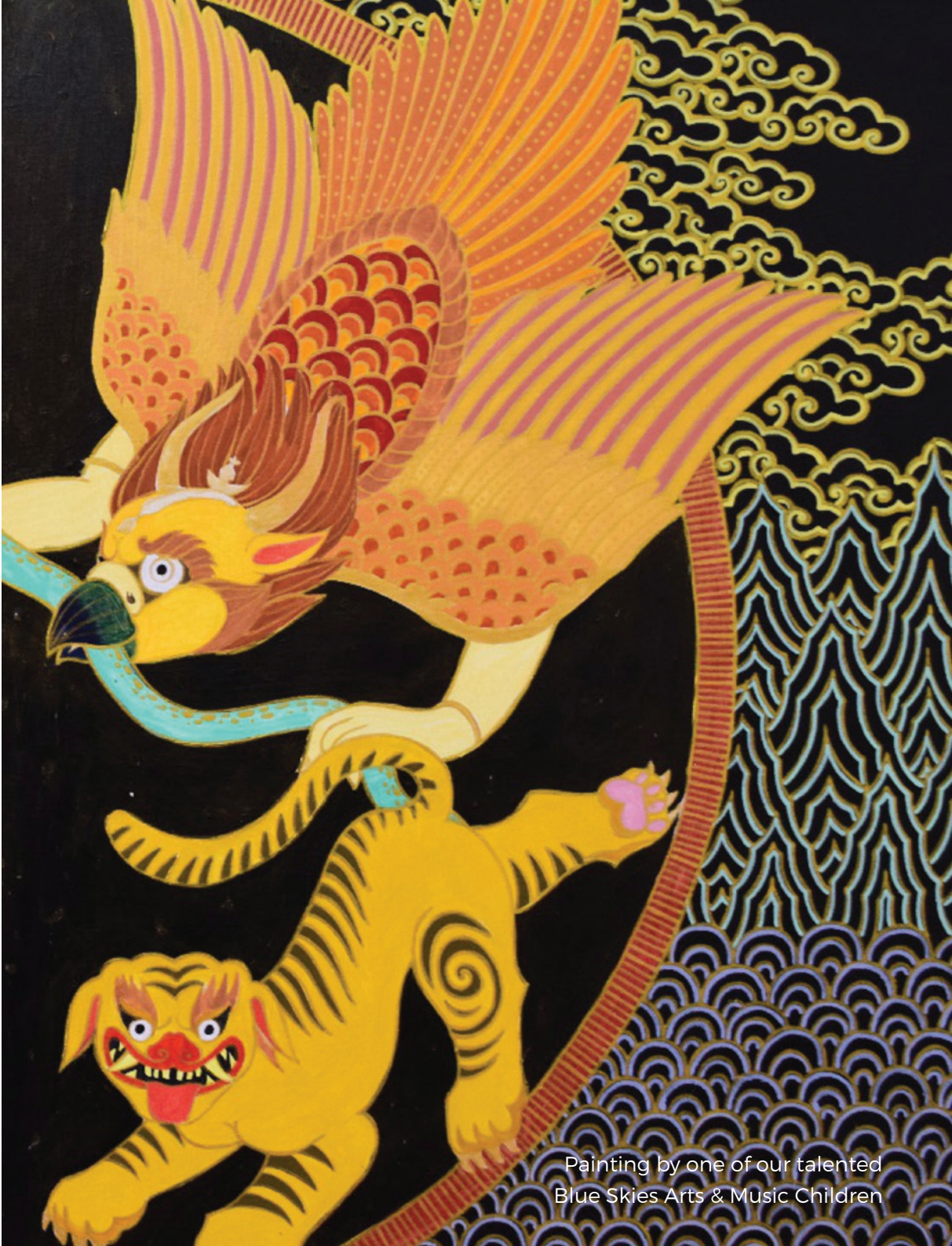
Painting by one of our talented Blue Skies Arts & Music Children