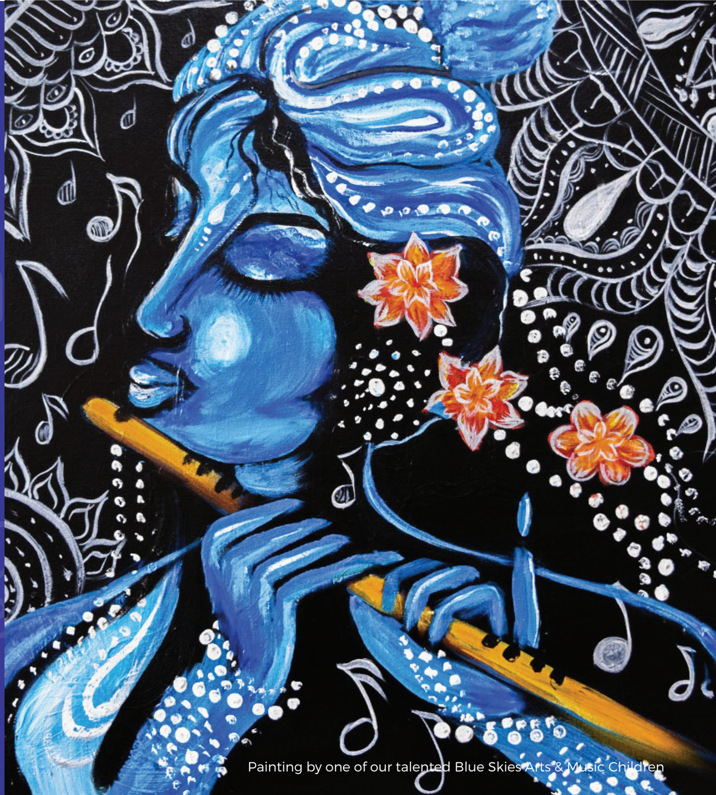
Painting by one of our talented Blue Skies Arts & Music Children