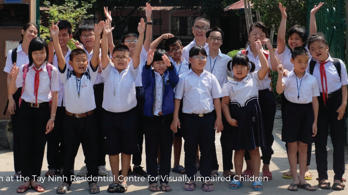
Our Sunshine Children at the Tay Ninh Residential Centre for Visually Impaired Children