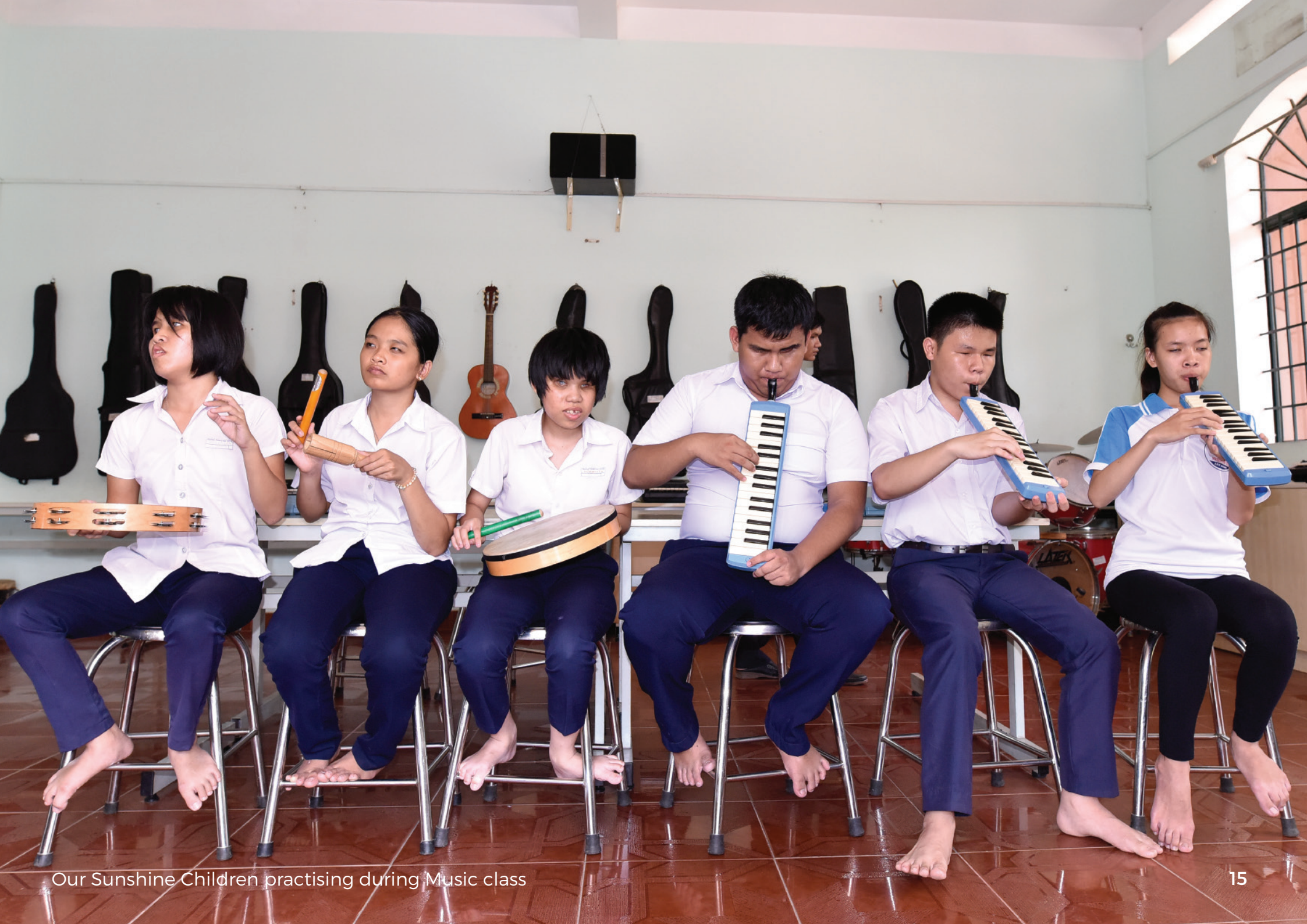
Our Sunshine Children practising during Music class