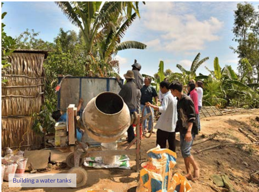
Building a water tanks