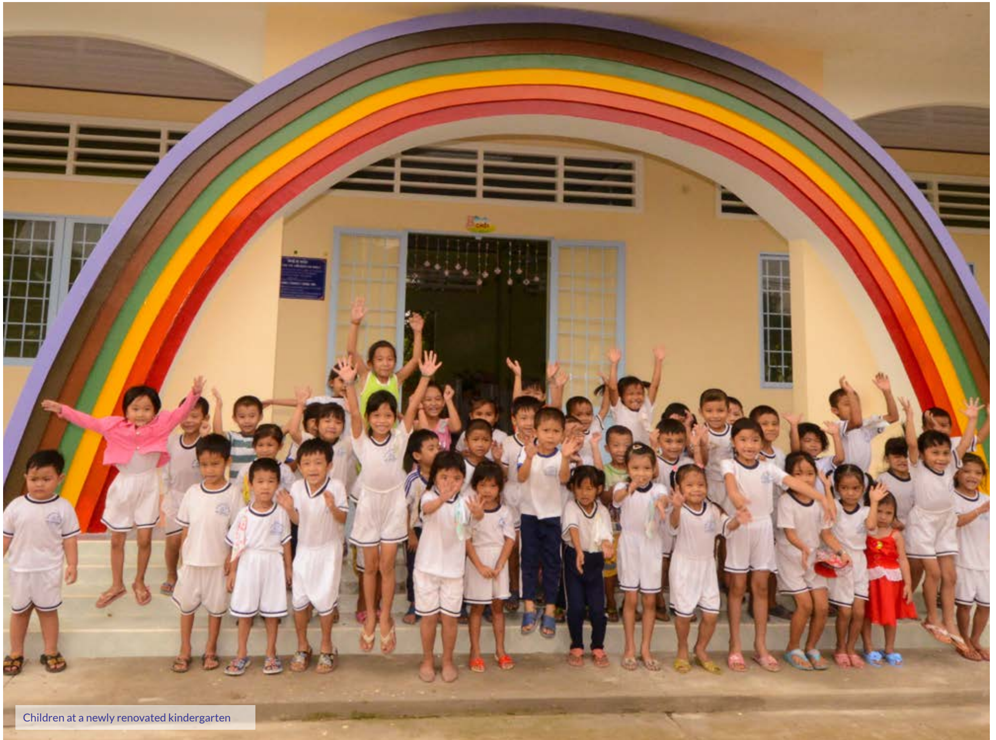
Children at a newly renovated kindergarten