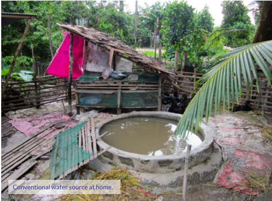
Conventional water source at home.