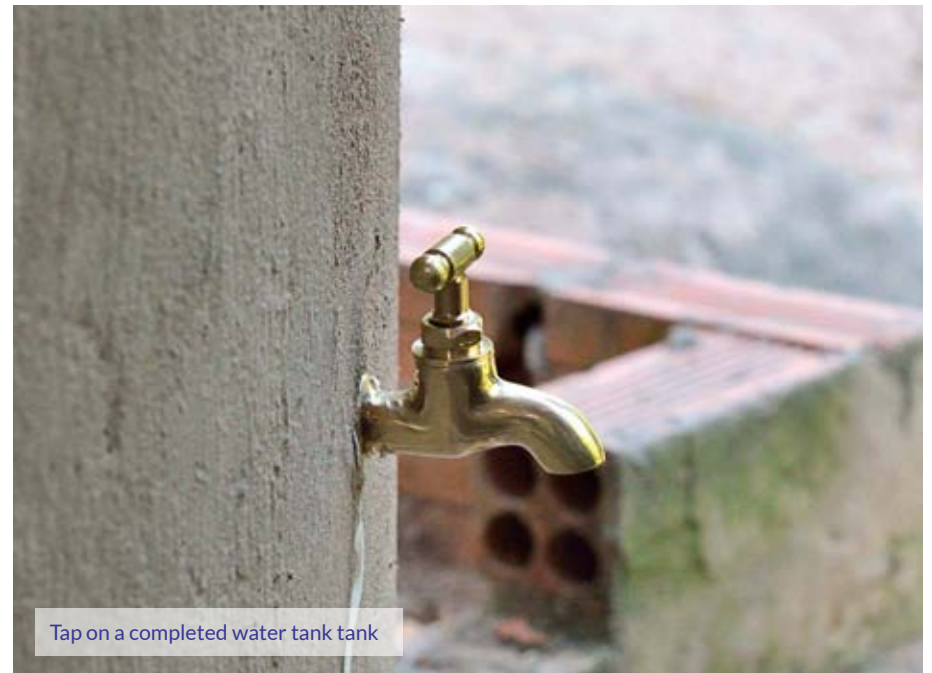
Tap on a completed water tank tank