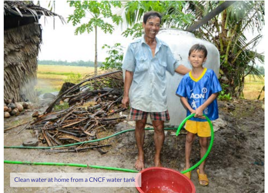
Clean water at home from a CNCF water tank