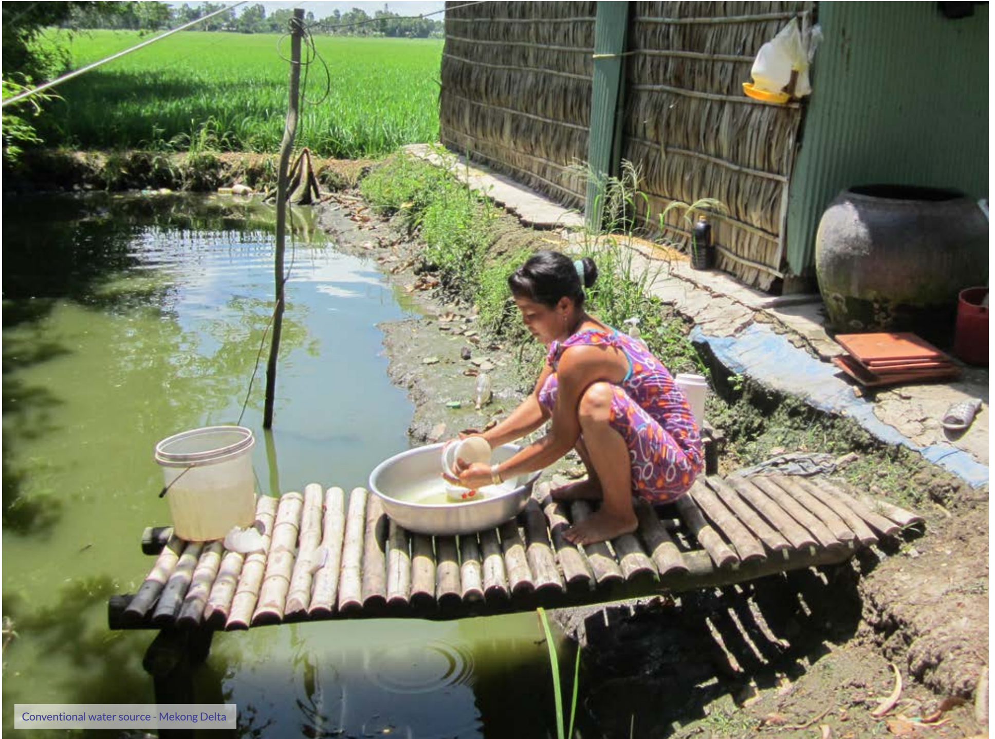
Conventional water source - Mekong Delta