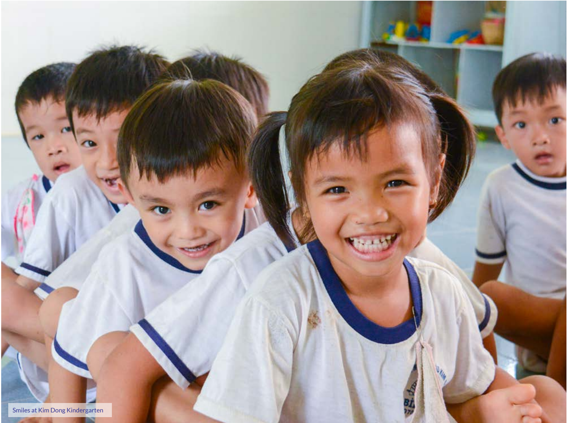
Smiles at Kim Dong Kindergarten