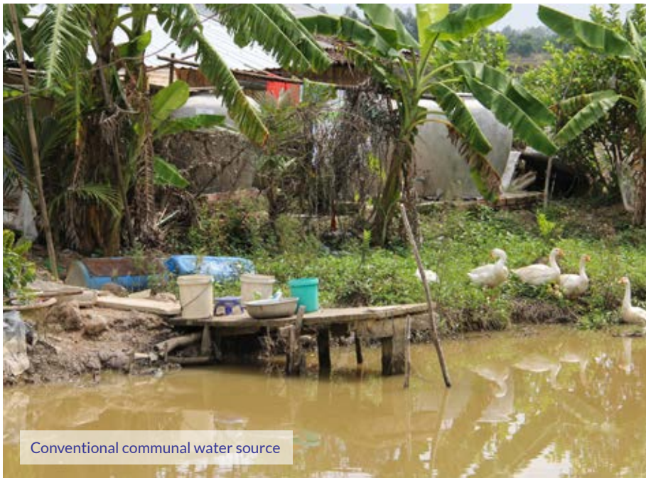
Conventional communal water source