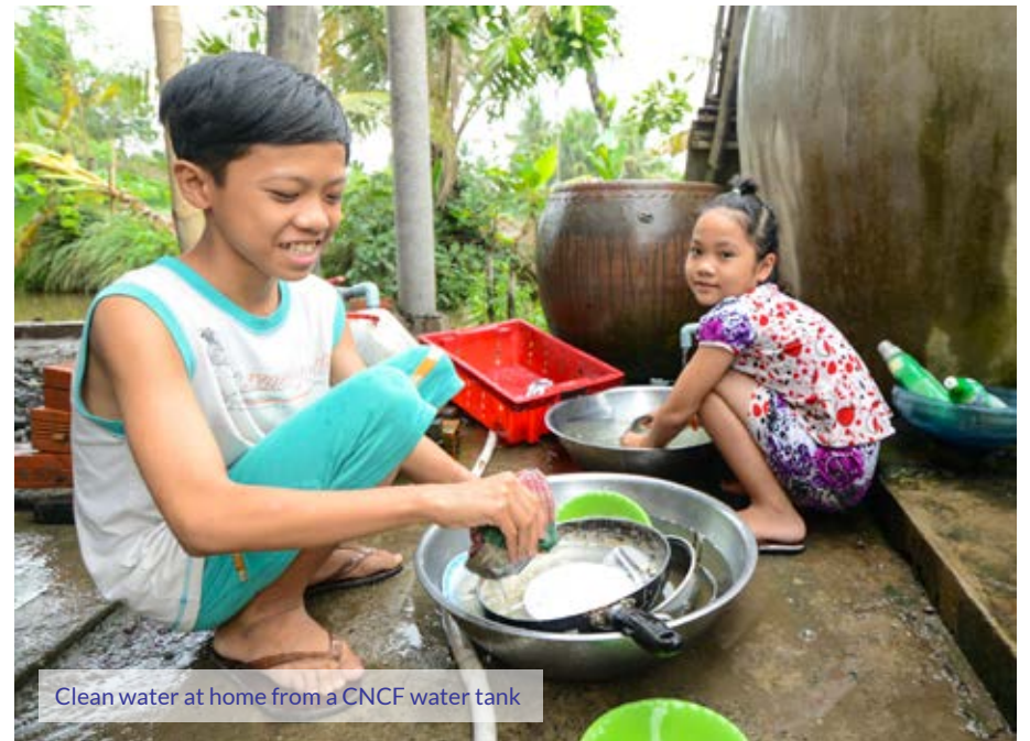
Clean water at home from a CNCF water tank