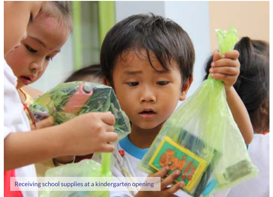
Receiving school supplies at a kindergarten opening