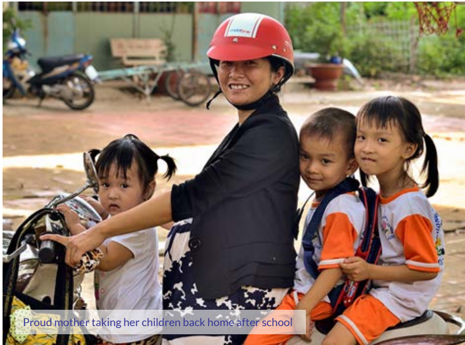
Proud mother taking her children back home after school