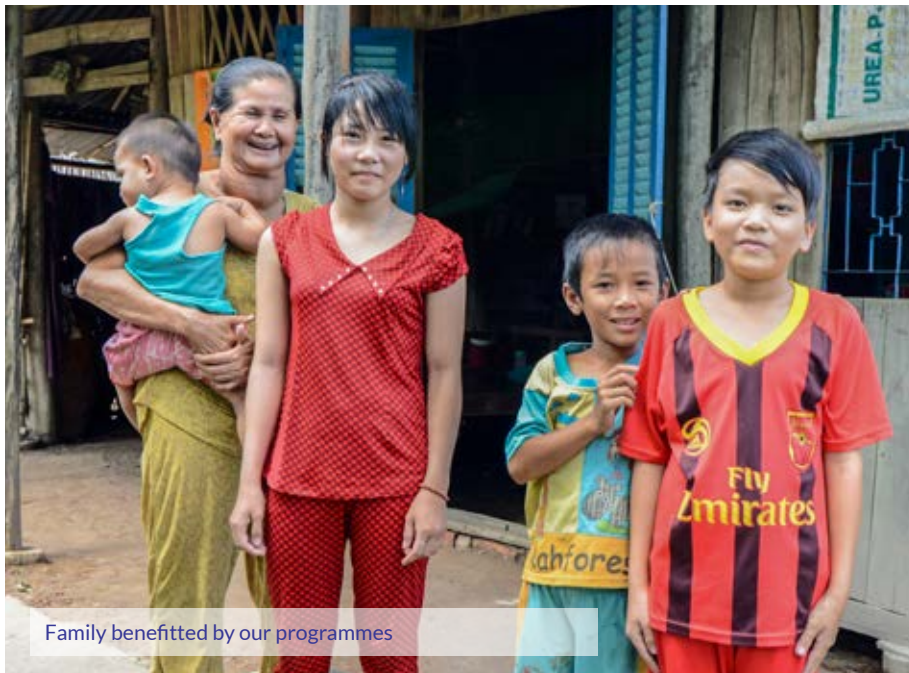
Family benefitted by our programmes