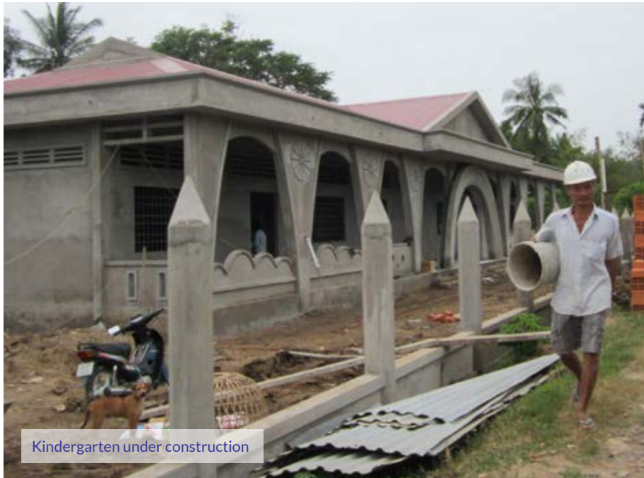
Kindergarten under construction