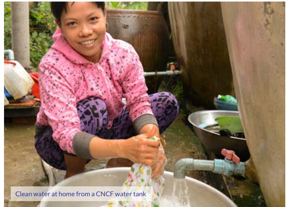
Clean water at home from a CNCF water tank