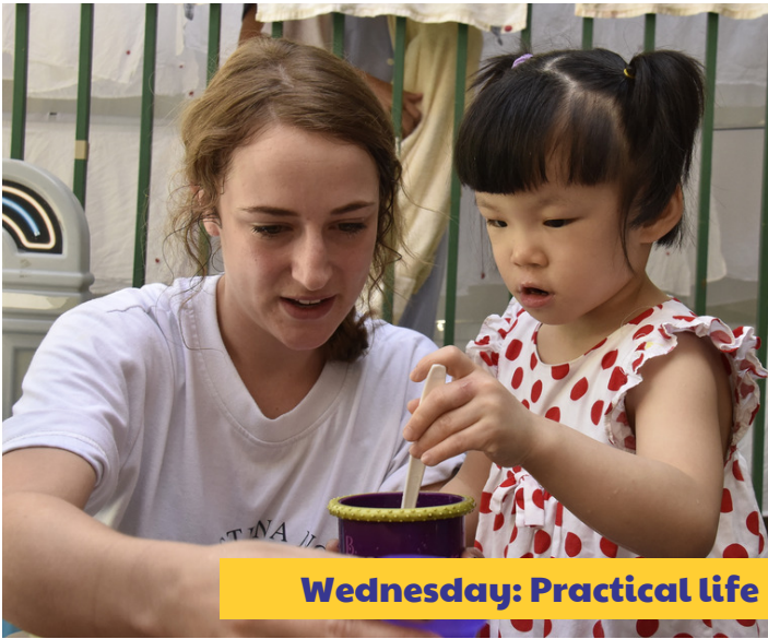
Wednesday: Practical life