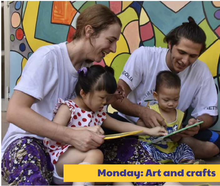
Monday: Art and crafts