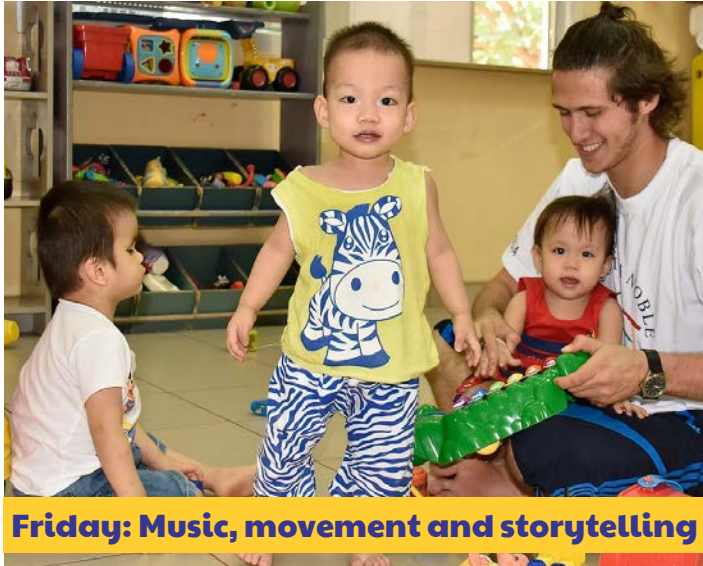
Friday: Music, movement and storytelling