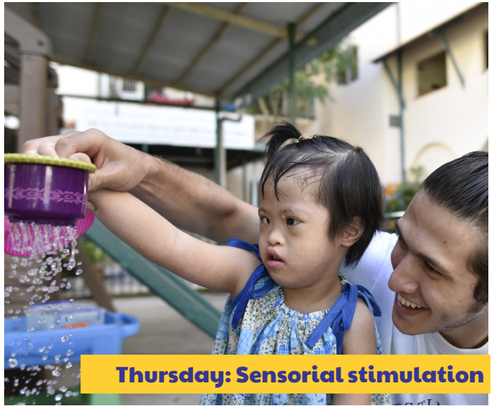
Thursday: Sensorial stimulation