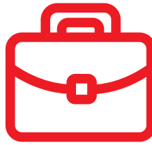
ARRIVAL & DEPARTURE