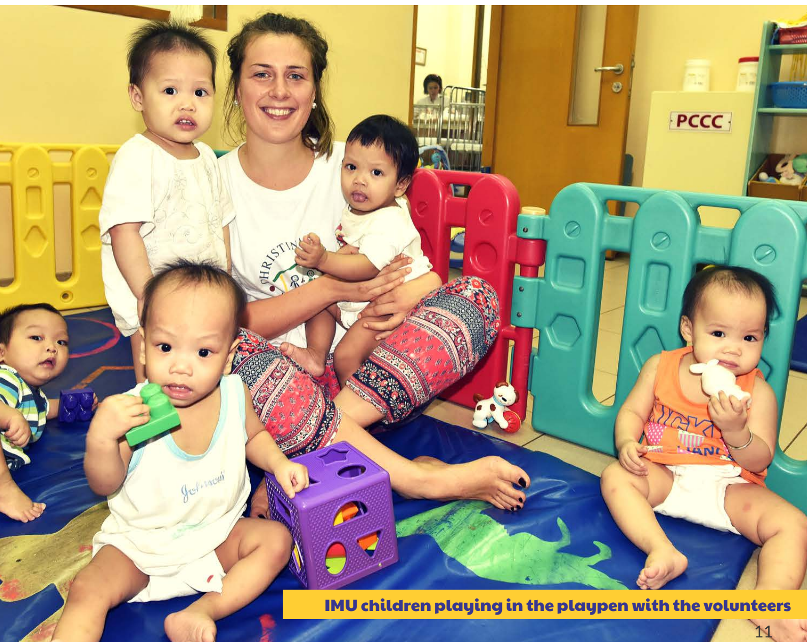
IMU children playing in the playpen with the volunteers

Be reassured that our Volunteer Coordinator will assist you as much as possible in making sure you feel comfortable in the various environments you will be expected to operate in whilst working with the children at CNCF.